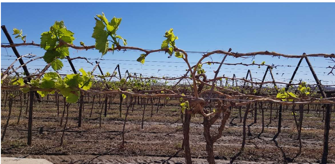
1 Young grape vines budding at Augrabies Sept20