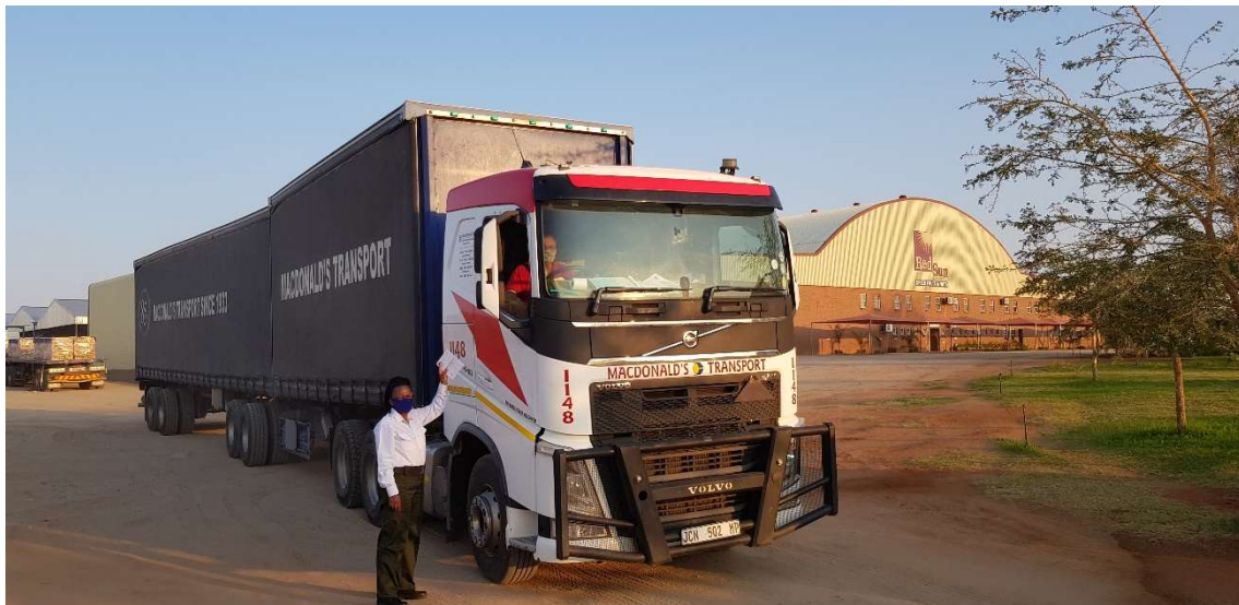
3 Dispatching our 10,000mt from our factory for 2020.

On 24 th September 2020, Redsun despatched our 10,000 th mt of raisins from our factory for the 2020 year, on its way to New York. Our previous “best” was 9,630mt which was despatched for the year 2018.