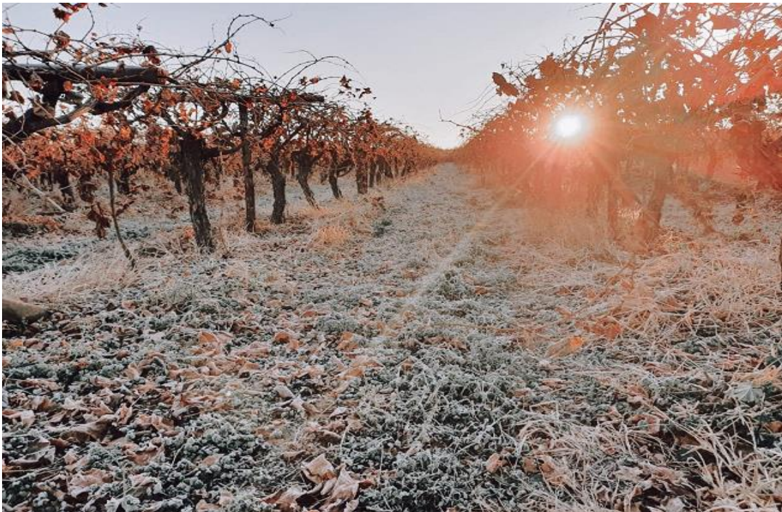
Cold weather in July. Perfect for the vines.

The farmers are out hunting! The weather and culture pattern is “normal” in our region, with good prospects for next season’s production.