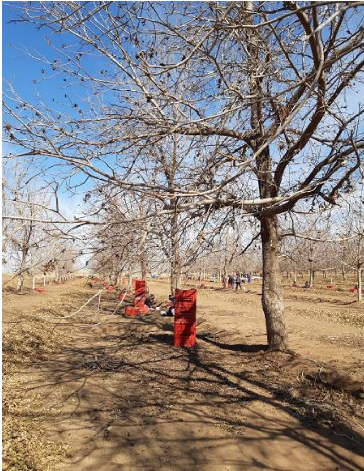
Pecans being harvested.