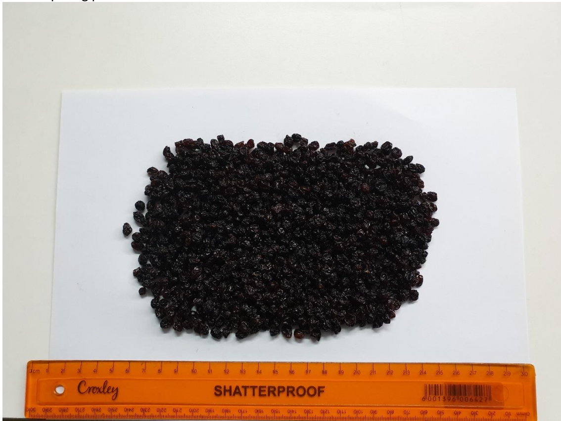
Currants with berry count 900-1300 berries per 100gr

Currants are available at very competitive prices now, due to the Euro exchange rate affecting the competing products from Greece.