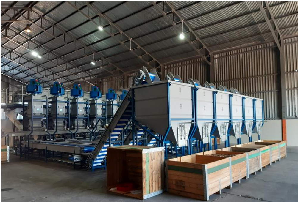
Redsun nut in shell processing equipment.

Our new pecan NIS processing machinery has arrived and we are packing our orders. We are selling NIS natural and polished in the medium, large and extra large sizes.