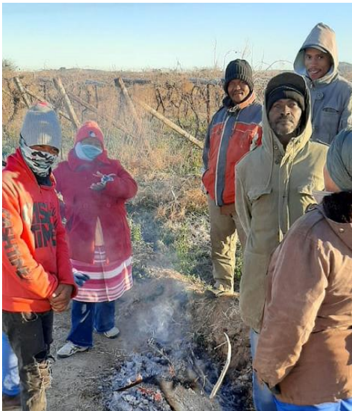
A Pruning team taking a break to warm up in the morning